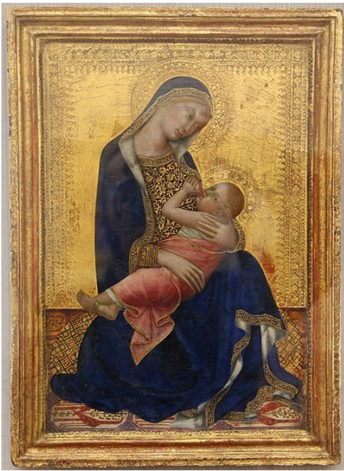
Madonna del Latte Lippo Memmi (1291-1356)